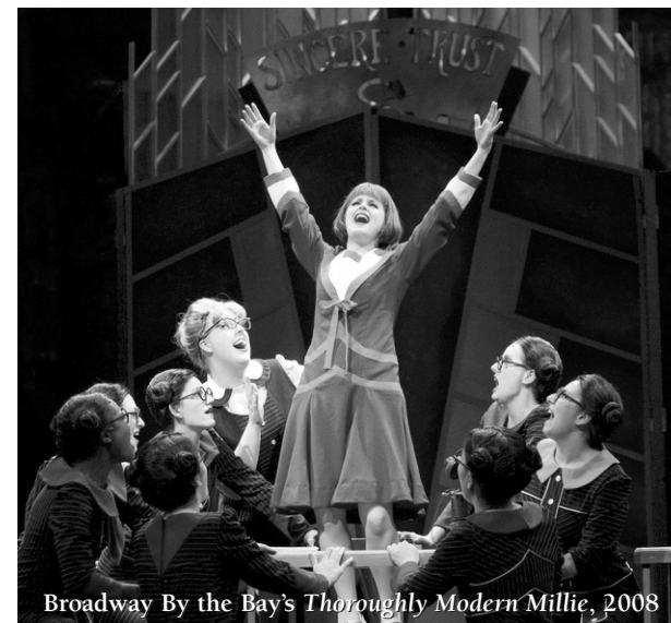
Broadway By the Bay's Thoroughly Modern Millie, 2008